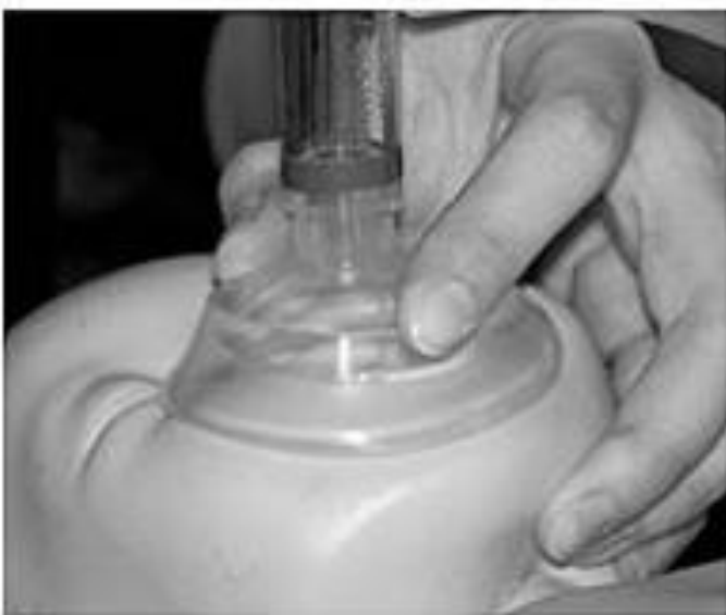
"C" Grip on face mask

Image from: F.E. Wood, , et al Improved techniques reduce face mask leak during simulated neonatal resuscitation: study 2; Arch Dis Child Fetal Neonatal Ed, 93 (2008), pp. F230–F234